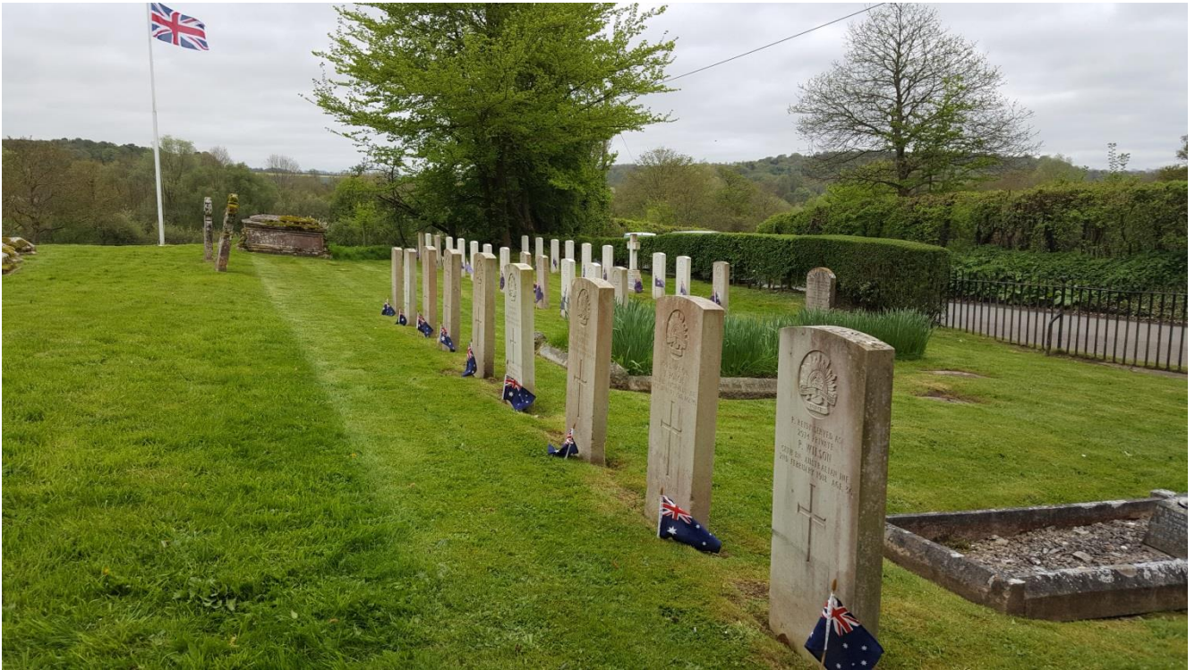
St. Edith's Churchyard, Baverstock