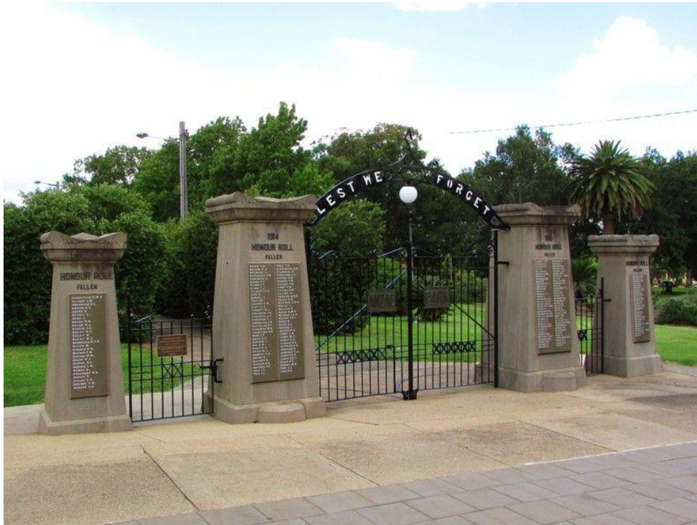
Anzac Park Memorial Gates, Tamworth